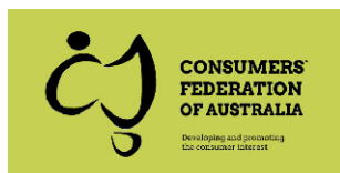
Consumers Federation of Australia